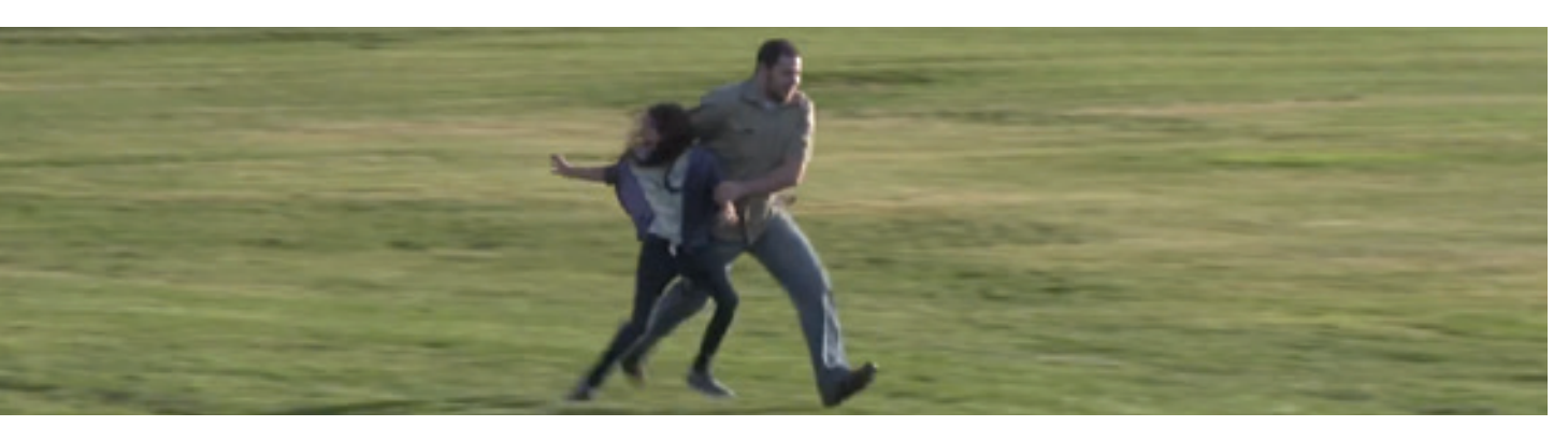
Photo from mock child abduction exercise, Riverton, Utah, September 5, 2013