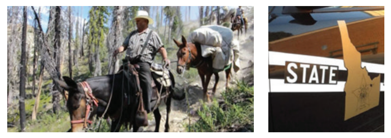
On August 9, horseback riders in the backcountry near Cascade, Idaho recognized a man and a girl that matched the description of the victim and suspect.